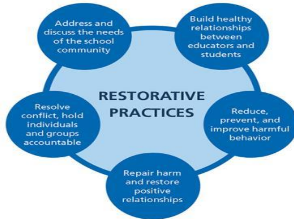
Figure 1. What Are Restorative Practices?